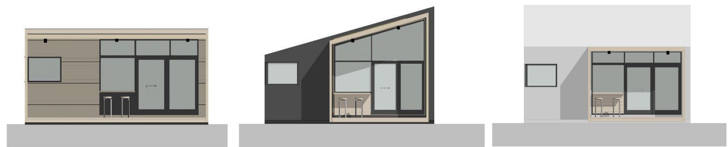
□ FLATROOF ▱ SLOPED PITCH ⌂ DOUBLE PITCH

39m 2 with a big deck 31m 2 with a small deck